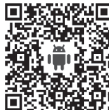
Android APP download

With our app, you can easily access vital information about your battery system, including charge levels, discharge rates, and any potential issues that may arise. Our cloud-based technology allows for seamless integration and remote access, giving you the peace of mind that your energy storage is being monitored and managed efficiently.