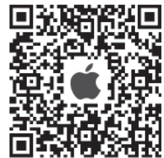
IOS APP download